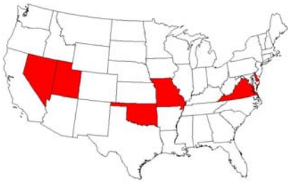
Statewide – Single