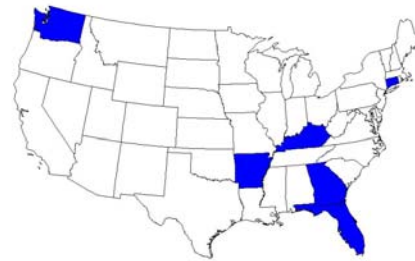
Statewide – Regional